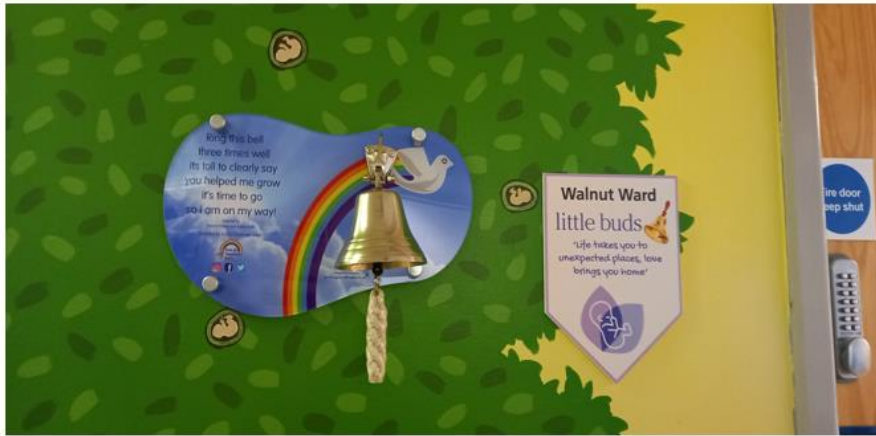
Darent Valley SCBU

If you have a spare wall or a space on your unit, these are some of the beautiful FICare related artwork/ wall decor found when we visited some of our units in KSS!