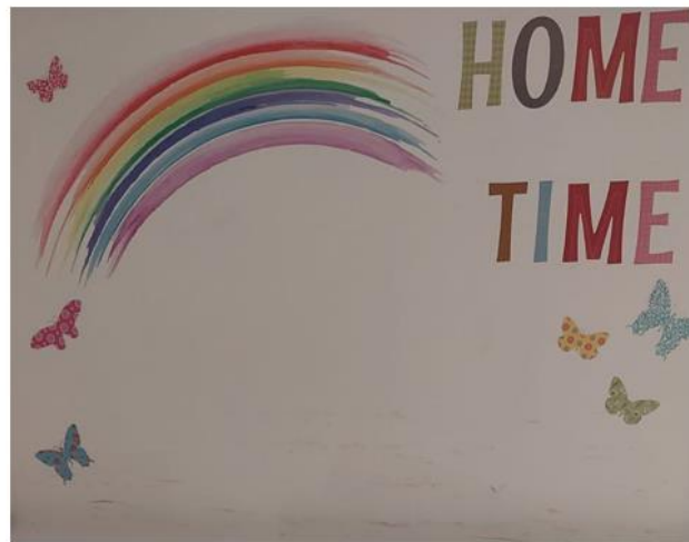
Selfie wall at Tunbridge Wells LNU