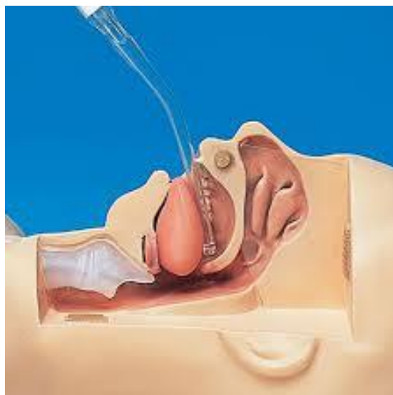
Diagram showing Oro-pharyngeal Suctioning, using a Yankauer Suction Catheter