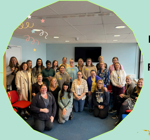
William Harvey Neonatal Unit February 2025