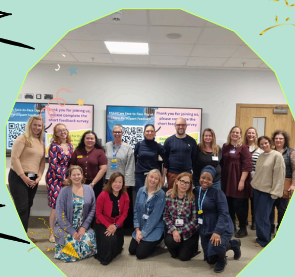
Trevor Mann Baby Unit October 2025